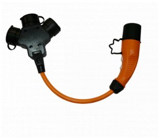
[AC02] TYPE 2 TO 3 X SCHUKO (3 X 16A)

http://eauto.si/metron-shop/?product_cat=ev-adapter (example)